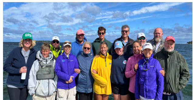
Last day of Scot racing

Newer Racers Participating in 2024. The best news about Fleet 44 this year is that we got a number of newer and intermediate sailors out on the water, giving them experience both on the tiller and as crew in our weekly races. If you know how to sail and are interested in racing on a Flying Scot, please contact me at nclaypool504@gmail.com .