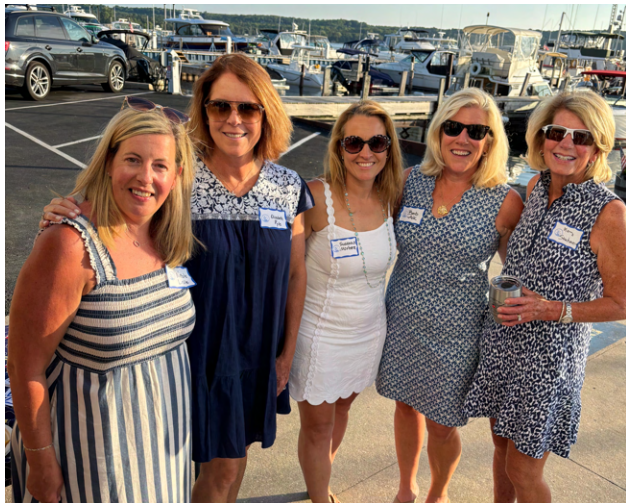
First Mates Sunset Social

I am happy to report that once again Bunco nights at EYC were a huge success. For those of you that do not know Monday nights are Bunco nights at EYC. This year we had many new members join us; it is a very welcoming group! Participants play a fun game, engage in lively conversation, meet new friends and catch up with old friends. Bunco also helps support our sailing program. This year Bunco raised close to $700. for our sailing program. We look forward to seeing you all next year!